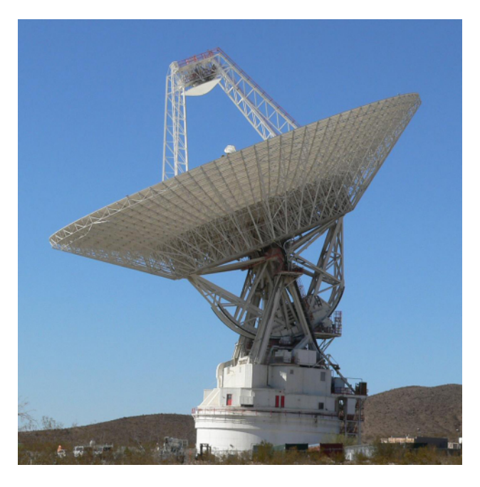
Figure 19.3 Radar Telescope. This dish-shaped antenna, part of the NASA Deep Space Network in California's Mojave Desert, is 70 meters wide. Nicknamed the "Mars antenna," this radar telescope can send and receive radar waves, and thus measure the distances to planets, satellites, and asteroids.

From the various (related) solar system distances, astronomers selected the average distance from Earth to the Sun as our standard "measuring stick" within the solar system. When Earth and the Sun are closest, they are about 147.1 million kilometers apart; when Earth and the Sun are farthest, they are about 152.1 million kilometers apart. The average of these two distances is called the astronomical unit (AU). We then express all the other distances in the solar system in terms of the AU. Years of painstaking analyses of radar measurements have led to a determination of the length of the AU to a precision of about one part in a billion. The length of 1 AU can be expressed in light travel time as 499.004854 light-seconds, or about 8.3 light-minutes. If we use the definition of the meter given previously, this is equivalent to 1 AU = 149,597,870,700 meters.